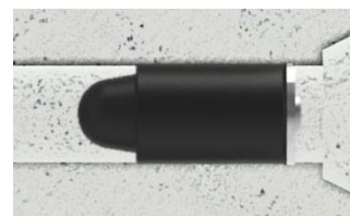
Rivestop with internal installation