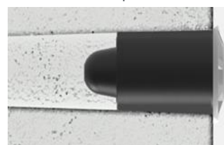
Rivestop with external installation